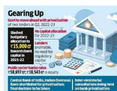
Figure 2 Gearing Up with Privatization

Strategy behind the privatization is to strengthen the balance sheet of these two public sector banks in order to generate potential investor interest and the government has slashed the allocation for bank capitalisation for the current fiscal by Rs. 5000 crores to 15000 crores for the FY 2021-22 and no provision for bank capitalisation were announced in the budget for 2022.23. The reason for no capital allocations is, as most of the state-run lenders are in profits and have plans to resolve the capital from the markets on their own strength. On 23 rd April, 2022, Mr. Sanjay Malhotra, secretary financial services said at the meeting which was a part of Manthan 2022 with top executive of public sector banks (PSBs) “Lenders have registered good profitability in the first three quarters of FY 22 and improved financials has enabled PSBs to raise Rs. 58697 crores from the market, inclusive of 10543 crores in FY 21 whereas it was just Rs. 29573 Crore. (Figure 2)